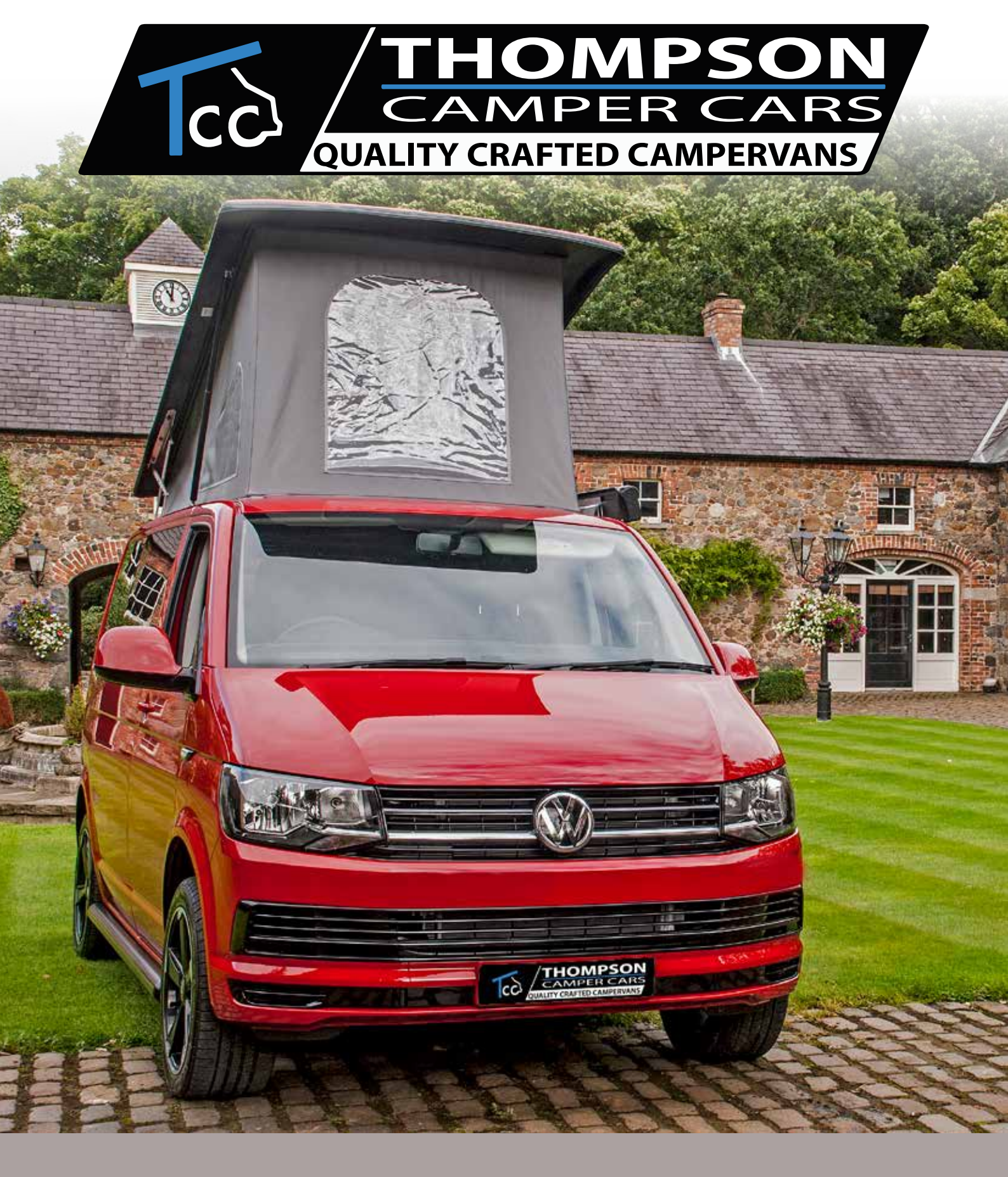
You'll go far in a Thompson Camper Car www.thompsoncampercars.com